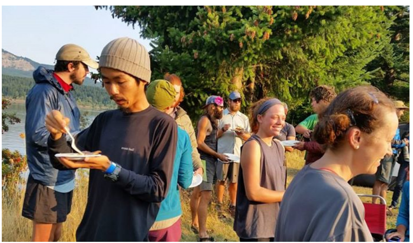
PCT Class of 2014ers at PCT Days enjoying pancake breakfast put on by ALDHA-W

PCT DAYS 10th ANNIVERSARY: AUGUST 28th-30th, Cascade Locks, OR