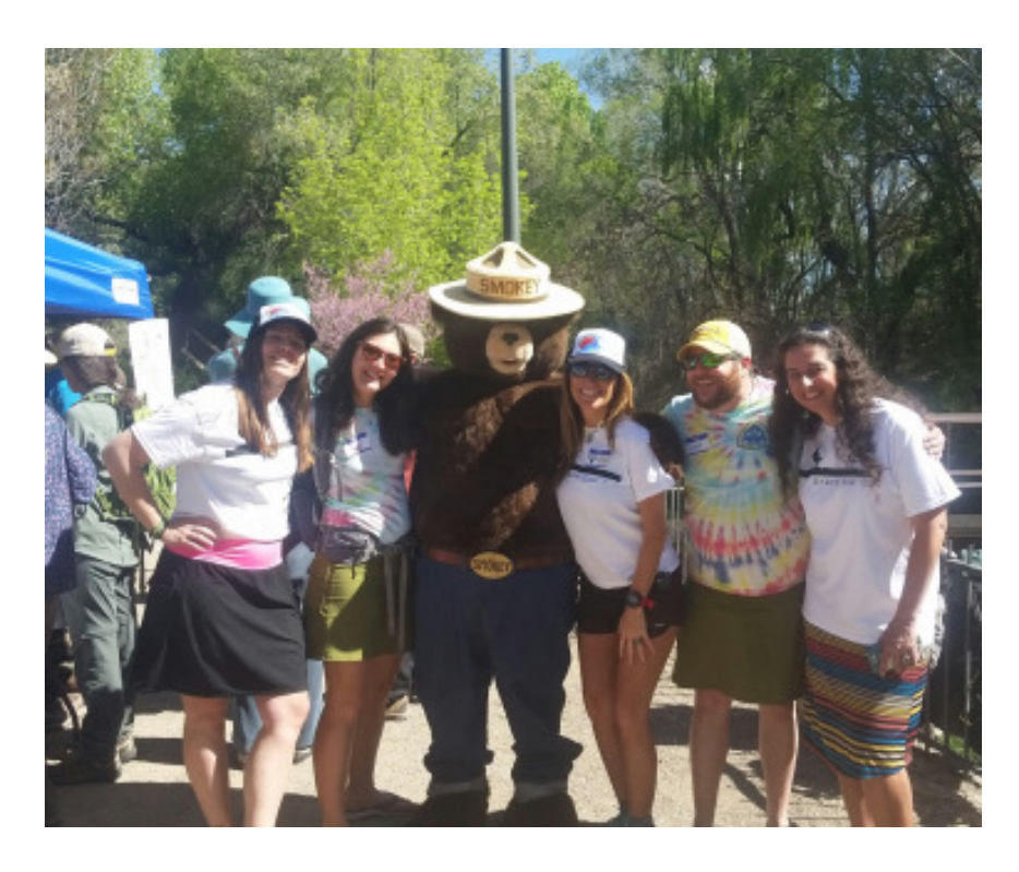
ALDHA-West members have a special moment with Smokey the Bear at the CDT Kick Off in Silver City, New Mexico.